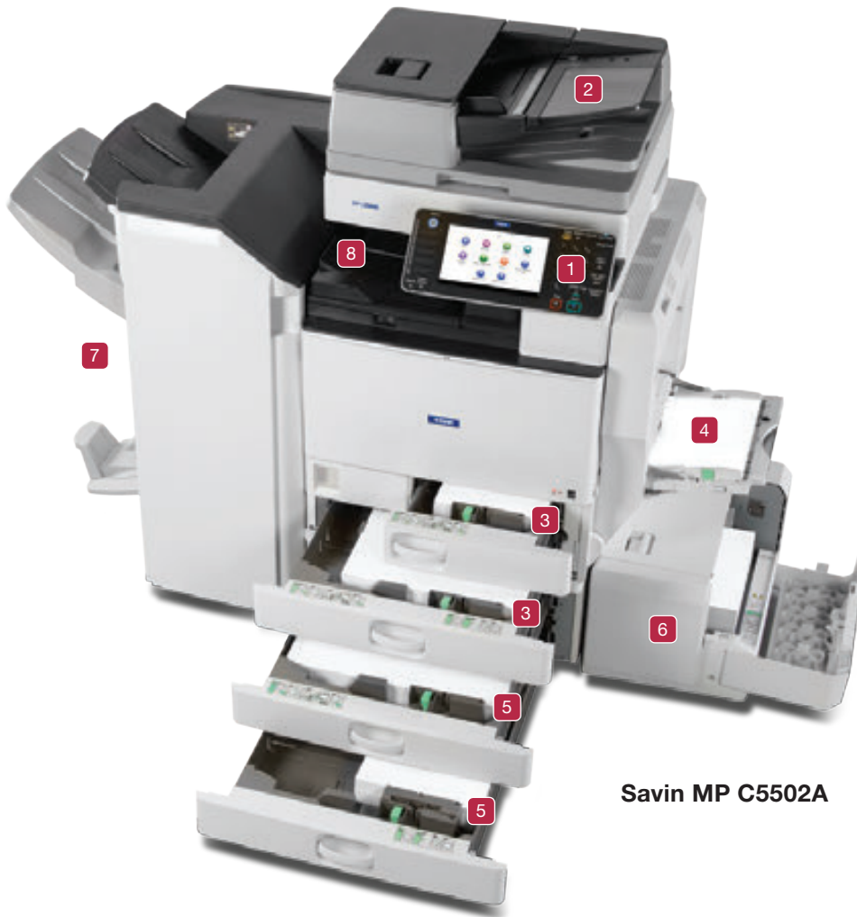
Savin MP C5502A