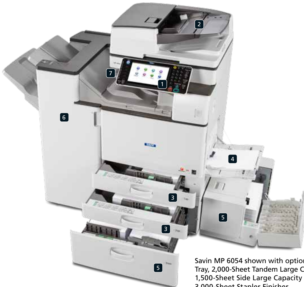
Savin MP 6054 shown with optional One-Bin Tray, 2,000-Sheet Tandem Large Capacity Tray, 1,500-Sheet Side Large Capacity Tray and 3,000-Sheet Stapler Finisher.