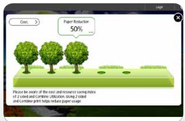
Eco-Friendly Indicator Screen as shown on the Smart Operation Panel.

The Savin MP 4054/MP 5054/MP 6054 offers low cost-per-page and best-in-class typical electricity consumption (TEC) values so you can reduce costs while meeting your sustainability goals. With a shorter recovery time of less than 5 seconds from sleep mode, the Savin MP 4054/MP 5054/MP 6054 keeps up with today's fast-paced business environment. You can program the device to power on or off during specified times to conserve energy for even greater savings. Plus, the device meets EPEAT® Gold* criteria — a global environmental rating system for electronic products — and is certified with the latest ENERGY STAR™ specifications.