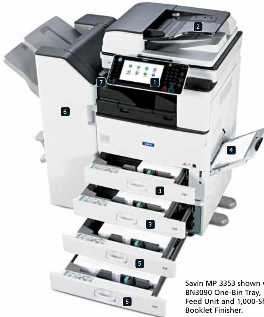
Savin MP 3353 shown with optional BN3090 One-Bin Tray, PB3180 Paper Feed Unit and 1,000-Sheet SR3150 Booklet Finisher.